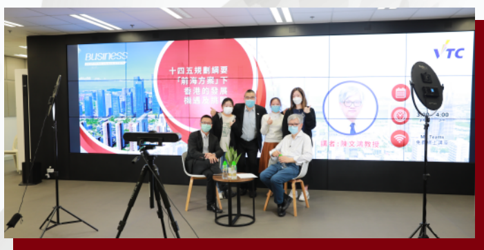
Guest Speaker interacted with the student emcee and student helpers from HD in Event Marketing and Digital Promotion