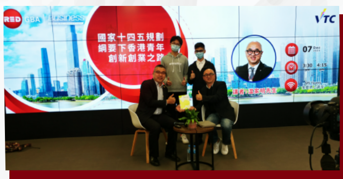
Guest Speaker shared his new GBA book with students for further studies