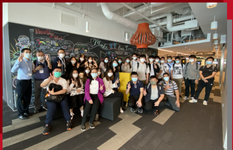
Students and lecturers took group photo at the end of the visit