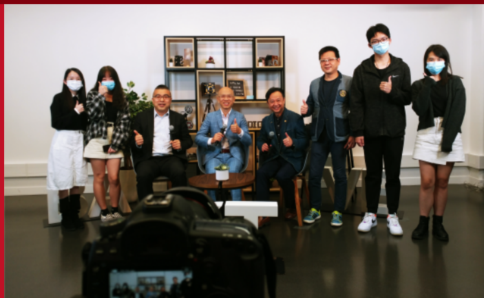
Guest Speaker interacted with the student emcee and student helpers from HD in Event Marketing and Digital Promotion