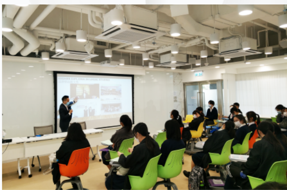
Students were very interested in knowing more about the work in law firms

Students from secondary school attended the taster programme of HD in Legal Studies. They demonstrated keen interest in law and were eager to know more about the programme.