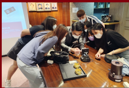
Students were learning the techniques of testing diamond quality