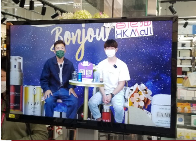
Students were performing a live-streaming selling activity

and techniques of having a live-streaming exercise. Students were then invited to perform a live-streaming selling.