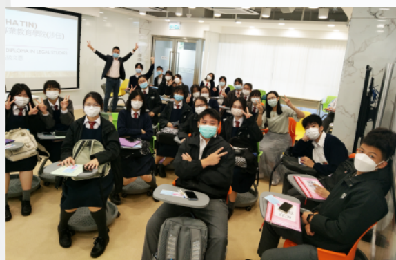
Students enjoyed the taster programme