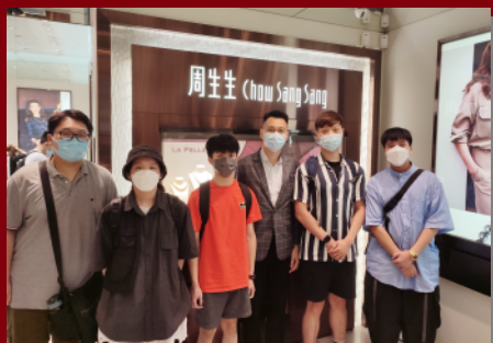
The regional manager of CSS photo with students