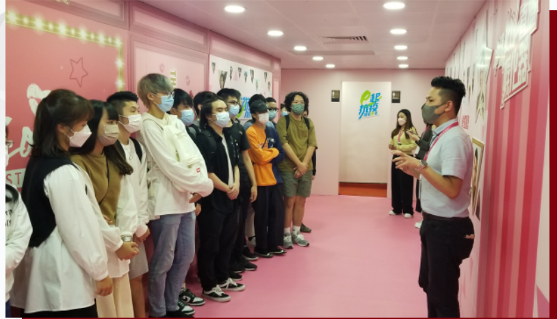
Live-streamer was introducing the operation of the live-streaming studio and the pink Avenue of Bonjour to the students