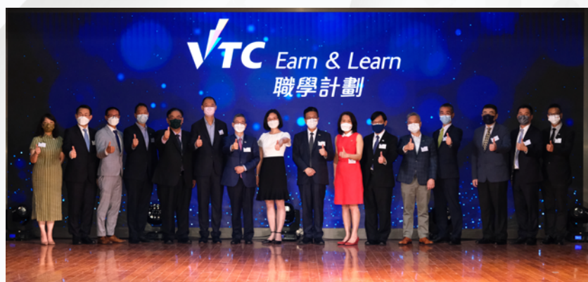
Representatives from the VTC, the Transport and Logistics Bureau and nine logistics and aviation companies hosted the launching ceremony

A signature event “VTC e-Commerce and Logistics Talent Day” organised by the Business Discipline was successfully held at IVE (Haking Wong) on 15 July 2022. The major objective of the event was to promote the latest development of the e-Commerce and logistics sectors and to celebrate the kick-off of our collaboration with those prestige industrial partners under the Earn & Learn (E&L) Scheme. It also provided valuable opportunities for students to interview with employers for apprenticeship vacancies.