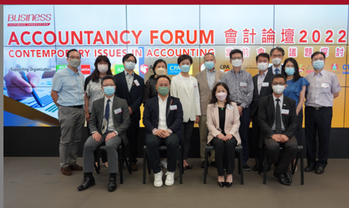
Group photo of Honorable Guests