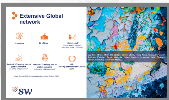
ShineWing Human Resources Manager delivered online recruitment talk

ShineWing is a premier provider of professional services, specialising in audit, tax, advisory and business services. An online recruitment talk was conducted for over 150 participants from the HD in Accountancy with Business Analytics on 11 April 2022. The career fair provided information about various job and internship opportunities in Audit & Assurance Services, Tax & Business Advisory Services, Risk Services, Financial Advisory Services and Environmental, Social & Governance units.