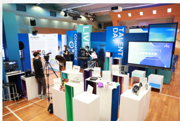
Students experienced the live streaming operation in the KOL and live commerce corner

The “VTC e-Commerce and Logistics Talent Day” also demonstrated the talent of our students and our interactive learning pedagogy to the visitors, including AR and VR demonstration in a simulated air cargo environment, KoL and live commerce demonstration, a showcase of the HKVTC Shop products, and the boardshow on the strategic development in the Mainland China.