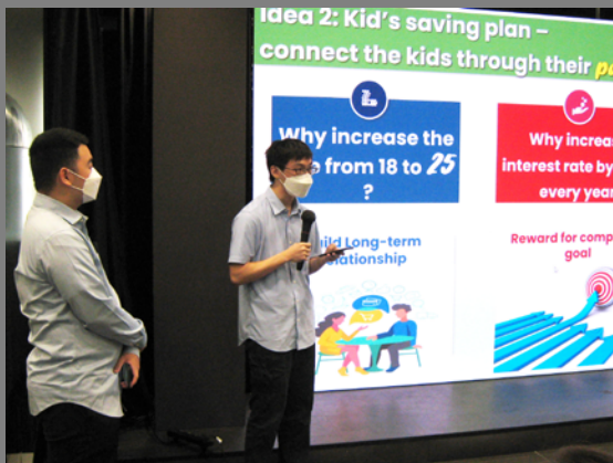
The students presented their ideas about branch innovation of Dah Sing Bank

the other five project groups from other disciplines and became the winner of the "FinTech and Innovative Award of the Branch Innovation Project 2021/22". They received good feedback from the judging panel on their presentation skills, team spirit and innovative ideas.