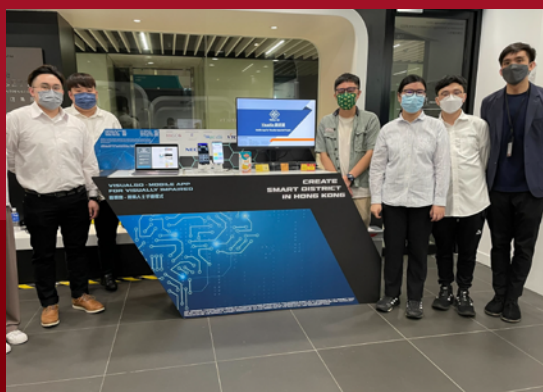
Students participated in the competition to resolve the challenges for VisualGo – Mobile App for the Visually Impaired