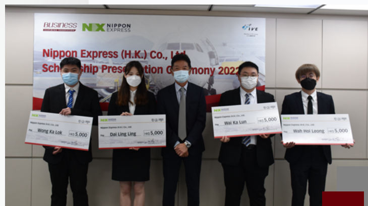
Nippon Express Scholarship Presentation Ceremony 2022

Four students of HD in Aviation and e-Logistics were awarded the Nippon Express Scholarships for their outstanding performances in the Nippon Express Essay Competition. The Managing Director of Nippon Express (H.K.) Co., Ltd. presented the Scholarships to the awardees.