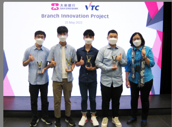
The students were celebrating with their supervisor after the award presentation ceremony