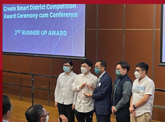
Student team from HD in Event Marketing and Digital Promotion was awarded the 2nd Runner-up at the ceremony