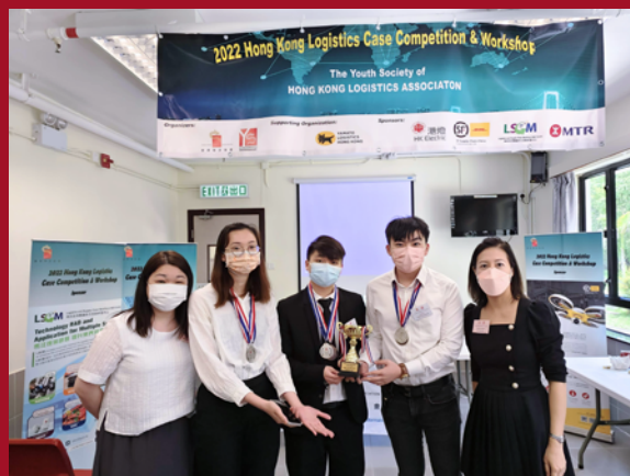
Group photo of the student teams who were awarded 3rd prize.