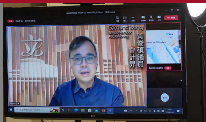
Hon. Wong Chun Sek Edmund, Legislative Council Member - Accountancy Functional Constituency, speaker of the webinar