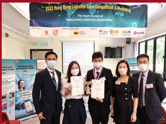
Group photo of the student teams who were awarded 1st prize.

and suggest solutions to a logistics operator. Their teams earned the first and third prizes which will certainly inspire them to pursue careers in the logistics field.