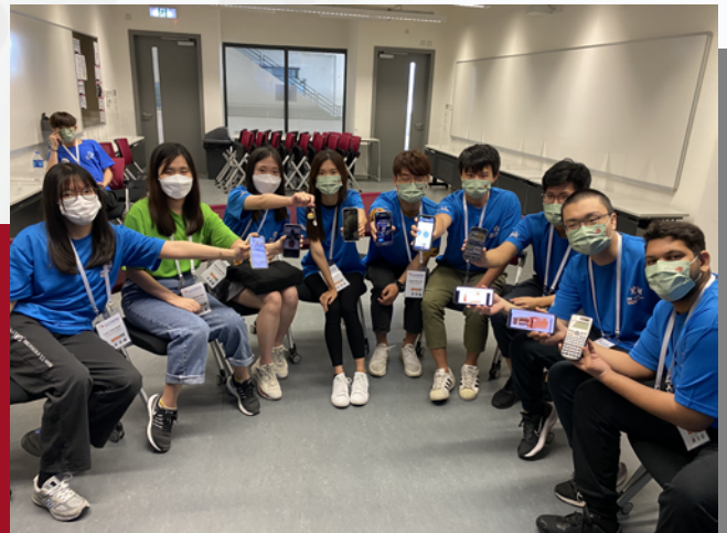
Team Bonding Activity