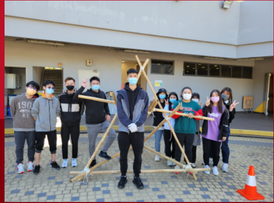
Students from HD in Human Resources & Talent Analytics worked as a team