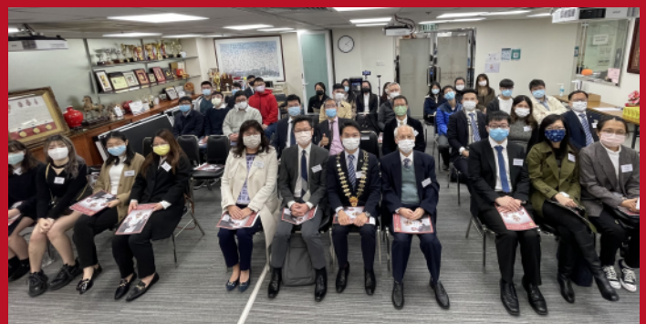
Group photo of Professional Accountant Internship Programme 2021