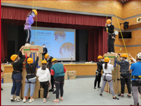
Students from HD in Human Resources & Talent Analytics was challenging the team-building tasks

Team-building activities go a long way in making everyone build trust. The importance of team-building activities can enhance team bonding and increase productivity. Students of HD in Human Resources and Talent Analytics participated in a Team Building Training Camp, one of the signature events of “HSBC Speak for Success” programme. The event was held in Wofoo Foundation Dr Joseph Lee Whole Person Development Education Centre on 3 December 2021. The experience gave students a valuable warm-up opportunity before starting their internship.