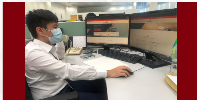
Workplace Learning and Assessment (WLA) with Expeditors Hong Kong Ltd