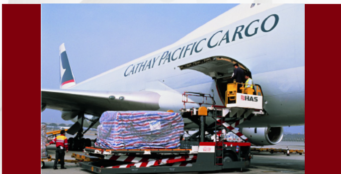
Learn practical airfreight operations

Moreover, the curriculum of the HD programme will also be revamped to incorporate the latest technology elements, including but not limited to, Smart Warehousing and Smart Air Cargo Operations with the support of VR/AR technology, applications of blockchain, IoT, object recognition, automation and robotic, High-valued/Special Cargo and Cold Chain Handling, Safety and X-ray Screening Security programmes in Air Cargo, to meet the manpower demand of the logistics industry.