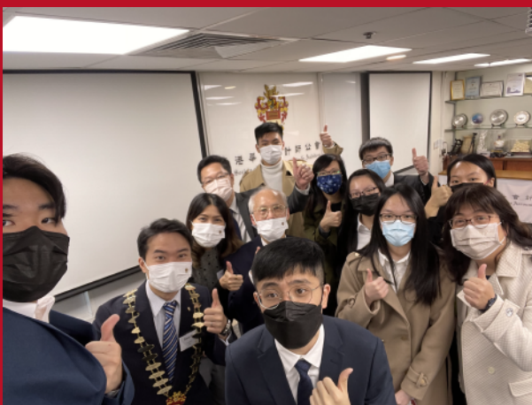
SCAA committee members and students

(會計專才實習計劃) 2021. SCAA also offered scholarships to students with outstanding performance in the internship. In the closing ceremony of the Professional Accountant Internship Programme 2021, the SCAA president, company representatives and students shared their views and benefits on the programme.