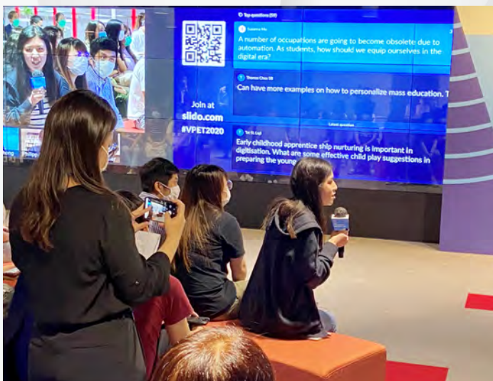
Students from Business Discipline participate in different sessions and raise challenging questions.

Students from Business Discipline participated in different sessions of the Conference and raised challenging questions. On the other hand, a production team from Higher Diploma in Event Marketing and Digital Promotion produced a video of teaching and learning materials by recording pre-event rehearsal, onsite live broadcasting and post-event dismantle.