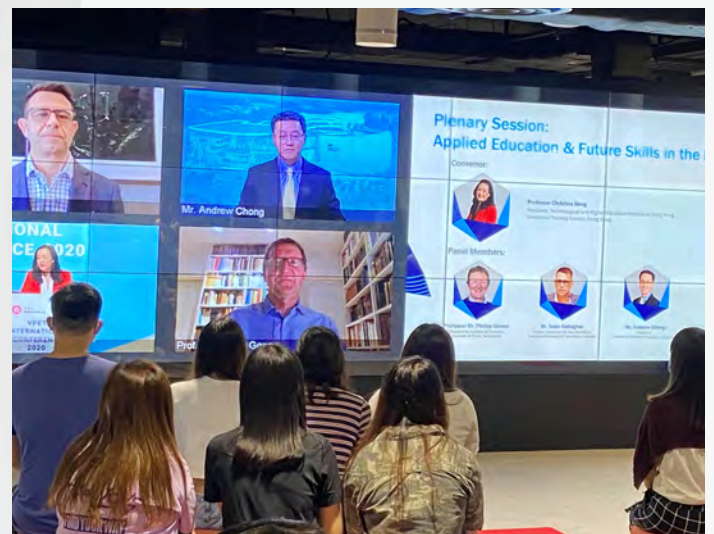
Themed " Skilling for the Future ", the VPET Conference in its first time conducted through online live broadcast.