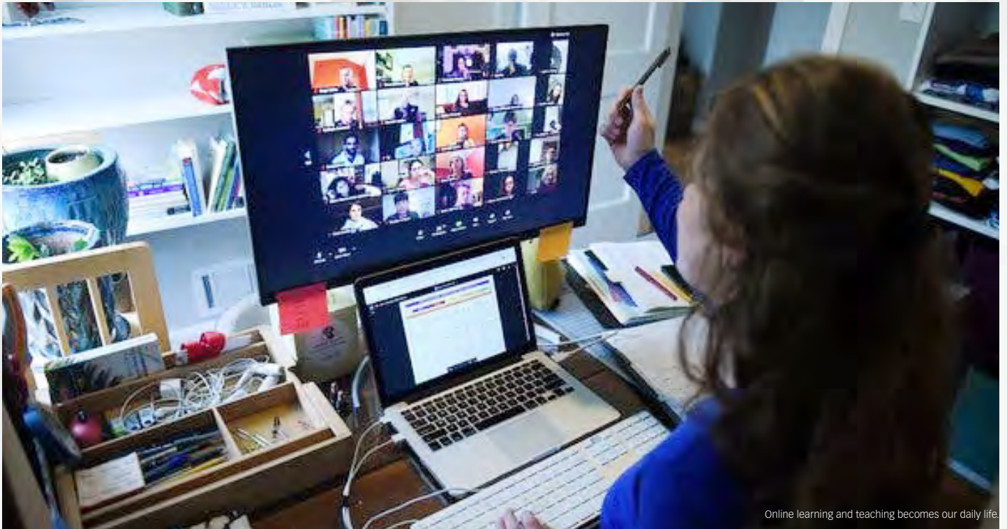
Online learning and teaching becomes our daily life.

The COVID-19 pandemic has forced us to change our way of working and living. It is online learning's big moment and education is about to be revamped just as much the industries that are going to remote work due to the coronavirus epidemic. The e-learning platforms such as MS Teams and Zoom are being used heavily. It accelerates our implementation of "Smart Workplace", which is one of the VTC initiatives. Educators have no choice but to adapt to the online teaching era.