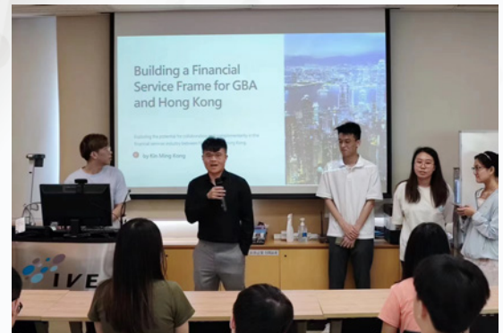
The group presented their findings on the case study.

A group of students and teachers from Guangzhou Huashang College visited IVE (Shatin) on 14 July 2023 as part of an academic exchange with HD in Banking and Finance Year-1 students. They visited the facilities at BOCHK Financial Services Learning Centre and tried banknote-counting activities. They formed groups with HD in Banking and Finance Year-1 students and engaged in discussions and presentations on the topic "粵港兩地如何在現有大灣區建設框架上加強金融服務合作, 以達致互補不足、促進資金流及金融發展?".