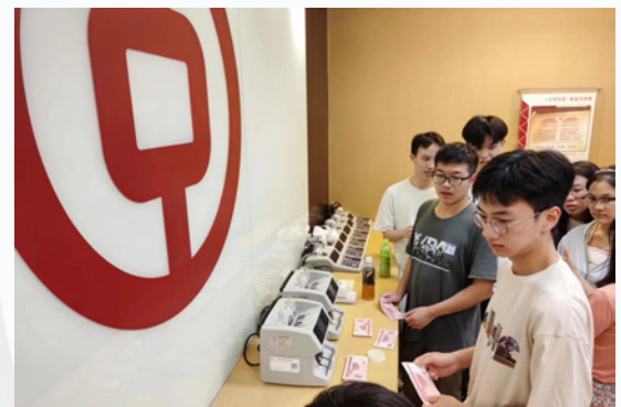
Students from Guangzhou Huashang College visited the BOCHK Financial Services Learning Centre.