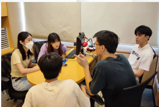
Both IVE and mainland students formed case study groups as part of their student exchange activity.