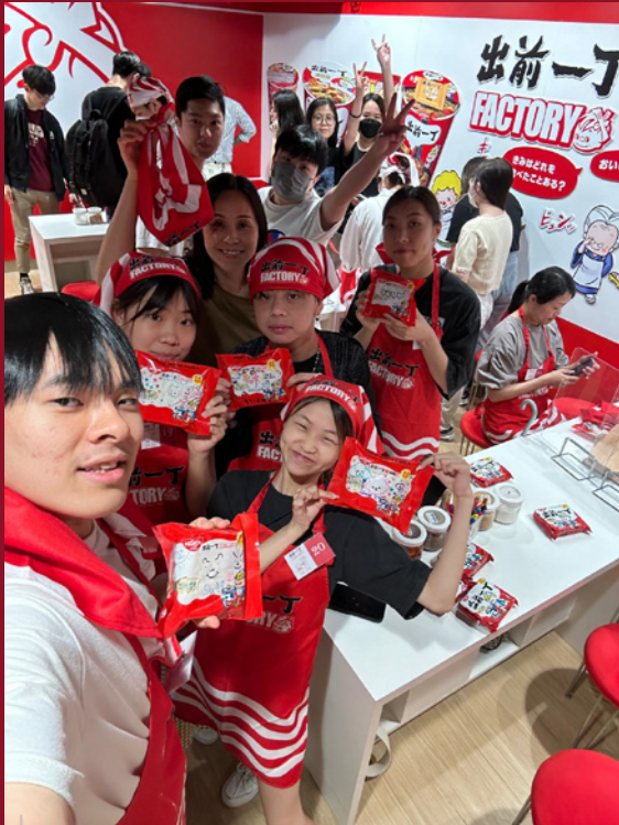
Everyone holds their own Demae Iccho (出前一丁) for a selfie after the completion of the workshop.