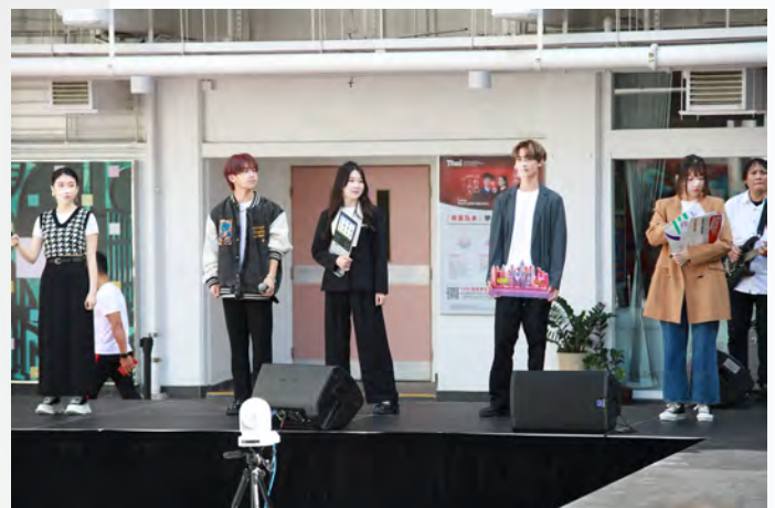
11 IVE student models modeled the same white shirt with different looks and introduced the Business programmes on the fashion runways.