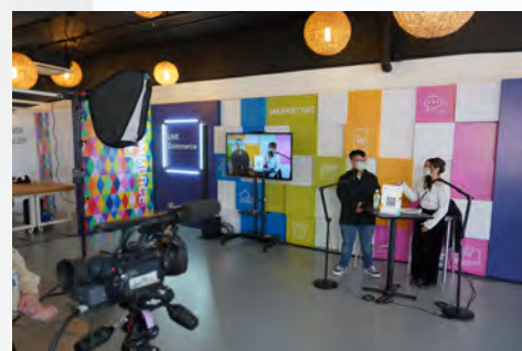
Students from Higher Diploma, Diploma of Foundation Studies, and Youth College of different campuses had fun at different game booths.