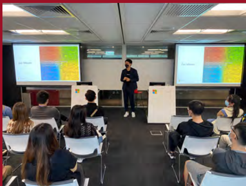
Consultant of Microsoft introduced and demonstrated their latest learning platform to the students.

In the face of the rapid pace of digitalization, HR practitioners acknowledge that digital transformation is essential for business growth. In such a context, it was a valuable opportunity for the Year 2 students of HD in Human Resources and Talent Analytics from (KT & TY) to visit the Microsoft Experience Centre. During the visit, the expert consultants from Microsoft introduced and demonstrated their latest HR analytic tools, real-time crowd system, AI application, RPA, and various technical facilities. It was an eye-opening opportunity for HRTA students to understand the development and implementation of technology.