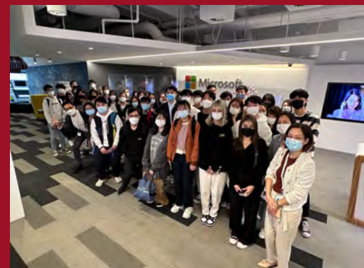
All HD in HRTA students and lecturers taking group photo at the end of the visit.