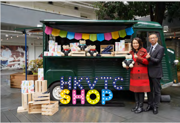
HKVTC Shop provides an e-commerce platform that aims to enhance the visibility of products designed or produced by VTC students and graduates.

The HKVTC Shop aims to benefit all VTC students through a dedicated e-Commerce platform. The platform offers a well-established, integrated, and VTC-branded sales and distribution channel for students to market their products and showcase their talents. It also provides an authentic training environment to nurture students with competencies required by the e-Commerce industry through the application of academic knowledge and the practice of vocational skills in a real business context. Students from the relevant programmes of different Disciplines will be engaged in the HKVTC Shop operation in the form of workplace attachment under Workplace Learning & Assessment (WLA).