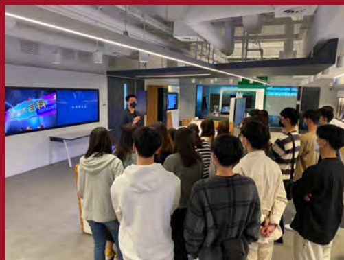
Students and lecturers participated the latest AI app provided by Microsoft Experience Centre.