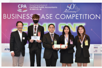
Best Presenter and Merit Team