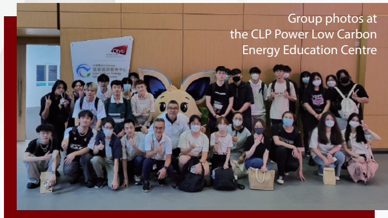
Group photos at the CLP Power Low Carbon Energy Education Centre

Students also enjoyed A2 beta-casein protein milk at "CityU MILK" shop thanks to the CLP volunteer team's arrangement during the visit