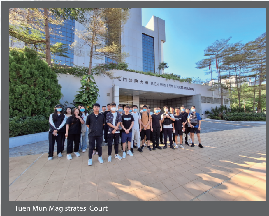
Tuen Mun Magistrates' Court

In order to facilitate the teaching and learning of BMT4107 General Legal Studies, a visit to Tuen Mun Magistrates' Court was organized on 3 November, 2023 for the HD in Management for Disciplined Services Year 2 students. Students attended traffic accident case hearings in the Court so as to learn more about the Judiciary and its operations.