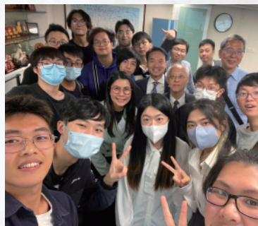
Company representatives and students

IVE launched the Professional Accountant Internship Programme 2023 in collaboration with The Society of Chinese Accountants and Auditors (SCAA) in the summer of 2023. SCAA invited all their members to offer internships to IVE Accountancy students, including scholarships to students with outstanding performance in the internship. A closing ceremony was held on 13 November 2023 to present the scholarships and express appreciation for the generosity of the companies.