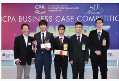
Best Written Proposal and Merit Team