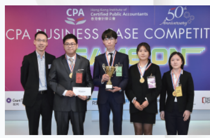
1 st runner up