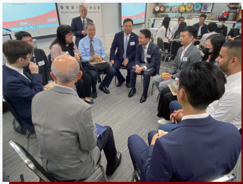
Sharing between company representatives and students