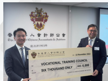
Presentation of Scholarship