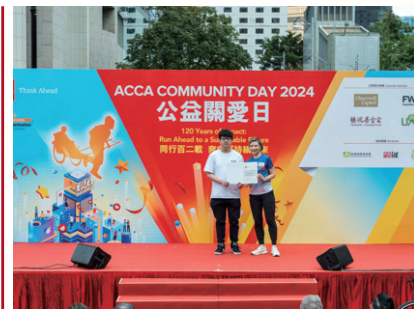
Letter of Appreciation to IVE(HW) student helper

The ACCA Community Day 2024 was held on 14 January 2024 (Sunday), providing a day of great fun with profound meaning for all age groups. The highlight of the event was the traditional rickshaw races, which were well-loved by the general public and business community. Over 20 accountancy students from IVE(HW) supported this fundraising event, which aimed to benefit three meaningful projects.