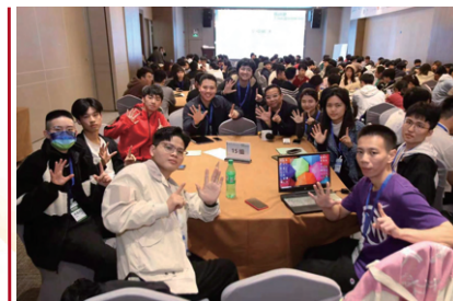
Brainstorming with keen discussion at Cyberport GBA YEP 2024