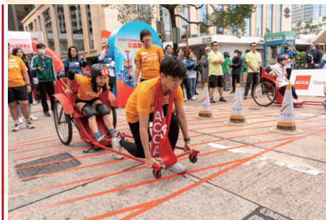
Student serving as time-keeper 1