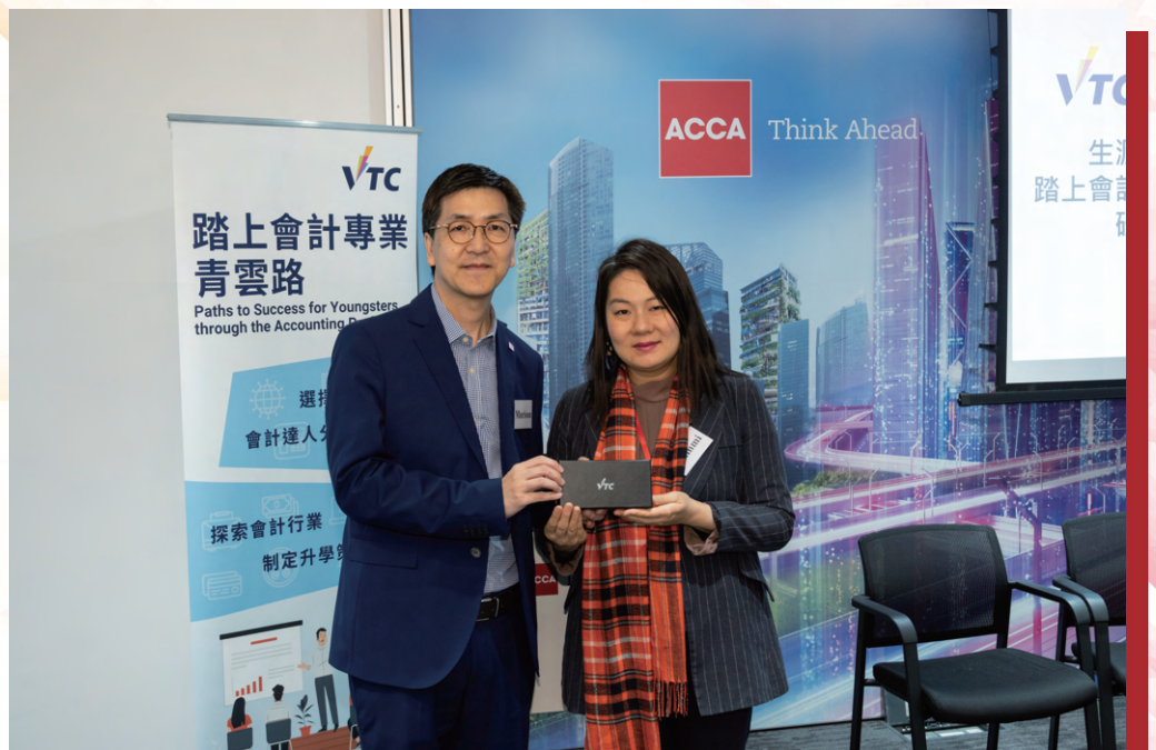
Souvenir presentation to Association of Chartered Certified Accountants (ACCA) HK