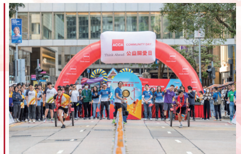
Student serving as time-keeper 2