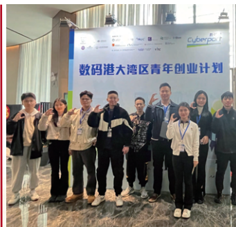
Team of 2nd Runner-up

Students from HD in Public Relations and Communication Management attended the 3-day Entrepreneurship Boot Camp and Roadshow Competition of Cyberport Greater Bay Area Young Entrepreneurship Programme (Cyberport GBA YEP) at Foshan on 19-21 January 2024. After several rounds of assessment, they won the 2nd Runner-up award. It is the first physical event since the COVID-19 pandemic and attracted over 400 applications of young participants from Guangdong, Hong Kong, and Macao. The programme aimed to equip participants with professional knowledge including artificial intelligence and Web3.0.