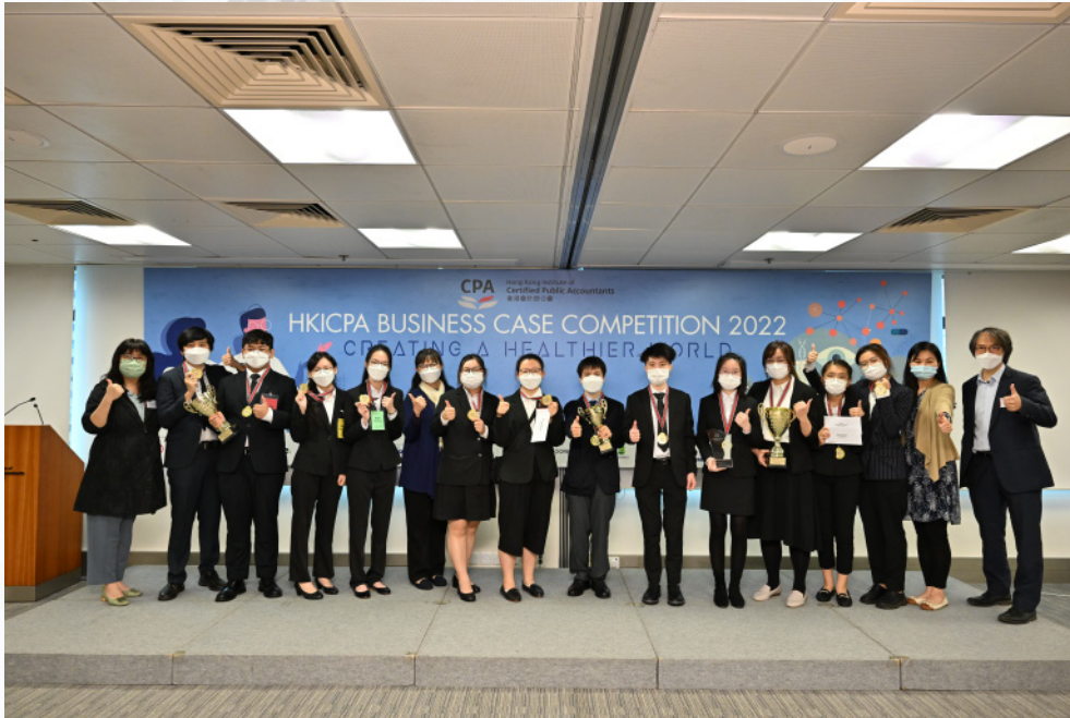
Group photo of winners in the HKICPA Business Case Competition 2022

The high level of professional knowledge and creativity already acquired by IVE accountancy students was demonstrated recently when they swept the awards in a business case competition organised by the Hong Kong Institute of Certified Public Accountants (HKICPA).