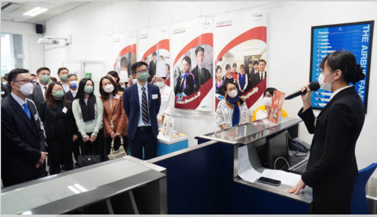
After the Signing Ceremony, the guests visited the Aviation Centre at IVE (Tsing Yi) to learn about the mock-up cabin and ground service counters supporting the teaching and practical training of aviation and passenger services.